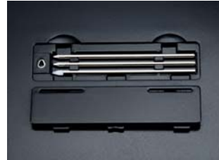
Two Replacement Ink Cartridges and One Plastic Pen Tip in the Cartridge Compartment